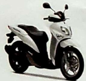
Yamaha Xenter 125cc