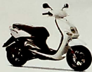
Yamaha Neos 50cc