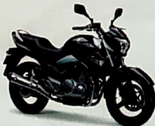
Suzuki Inazuma 250cc