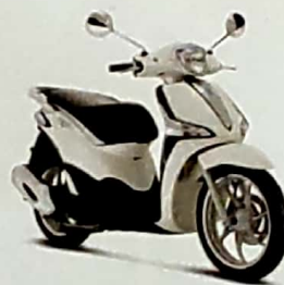
Piaggio Liberty 125cc