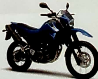
Yamaha XT 660cc